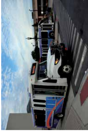
More information and to register at DutchessNY.gov/PublicTransit