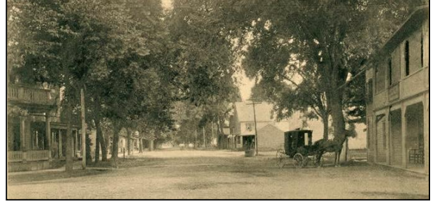
Main Street, Looking South