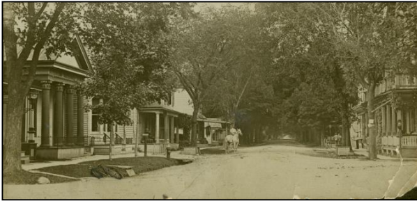
Church Street, Looking East