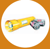
Flashlight with batteries