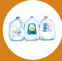
Lots of water