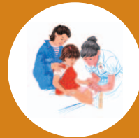
Know what to do if someone is hurt or sick