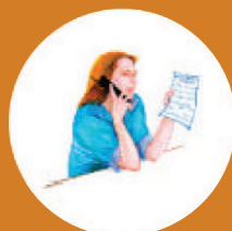
Know who to call for help