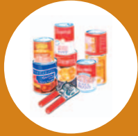
2-week supply of ready-to-eat food