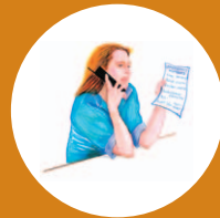
Know who to call for help