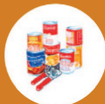
2-week supply of ready-to-eat food