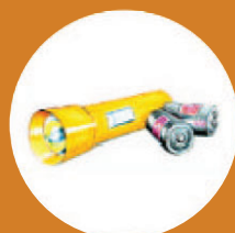
Flashlight with batteries