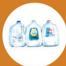
Lots of water