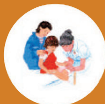
Know what to do if someone is hurt or sick