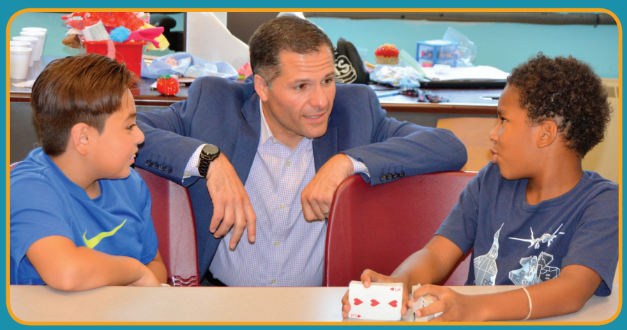
Marcus J. Molinaro Dutchess County Executive

56,000 Children & youth call Dutchess County home